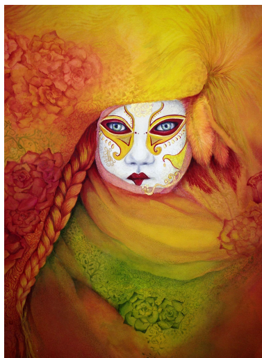
Sherry Cummings, I C U , Watercolor on Paper