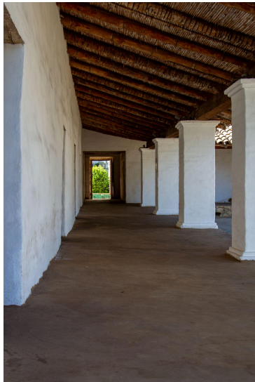
Don Cresswell, The Doorway Awaits You , Color Photography