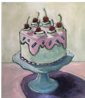
Pamela McCauley, Let's Eat Cake , Oil Paint