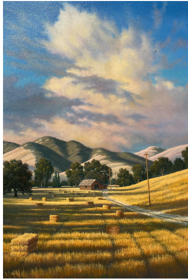
Charles White, In The Golden Hour , Oil